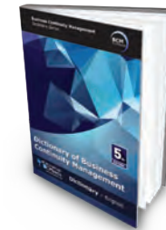
Dictionary of Business Continuity Management 5th Series