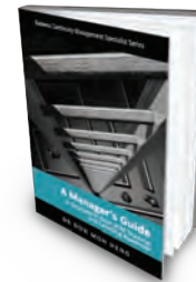
A Manager's Guide to Implement Your BCM Training and Learning Roadmap

The first 10 confirmed and registered participants will receive a copy of the